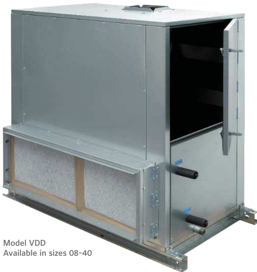
Model VDD Available in sizes 08-40